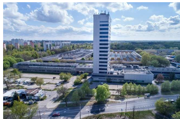
Photo: CeMat complex, Wólczyńska 133, Warsaw, Poland

The CeMat buildings are accommodated by warehouse, production, office and social space constructed mainly in the 1980s.