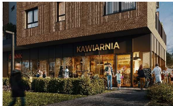
*Concept visualisation of the development

After all the milestones above have been achieved, there will be an opportunity to significantly increase the value of each of the plots in the current portfolio for the best possible price. The scope of the additional work of the CeMat team for each of the plots and projects will be analysed on an individual basis, taking into account the potential risks, time frames, human resources and possibilities of obtaining additional benefits versus the current land value. Based on these factors, we will make a final decision about the benefits of carrying out development projects.