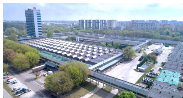
Photo: CeMat complex, Wólczyńska 133, Warsaw, Poland

The Group's liabilities totalled DKK 46.9 million as at 30 June 2022, consisting of lease liabilities of DKK 16.2 million, deferred tax liabilities of DKK 25.4 million, trade payables of DKK 1.2 million, a bank loan of DKK 1.0 million and other liabilities of DKK 3.1 million. They were DKK 2.6 million lower in comparison to the end of 2021.