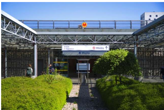
Photos: Warsaw, Bielany public transport

The Bielany district is very well-connected by the public transport system (metro, trams, buses) and the road network in/out of Warsaw.