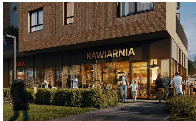
Concept visualisation of the development, Wólczyńska 133, Warsaw, Poland