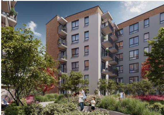
*Concept visualisation of the development

A comprehensive valuation report covering all the plots located in Bielany, Warsaw, will be prepared in December 2022.