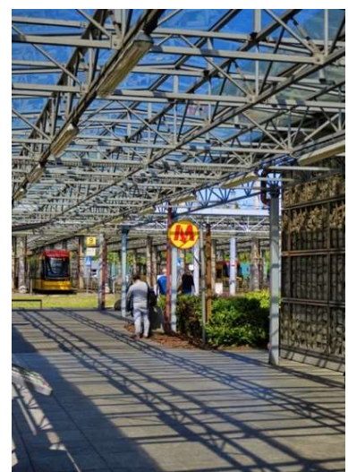
Photos of Bielany, Warsaw, Poland