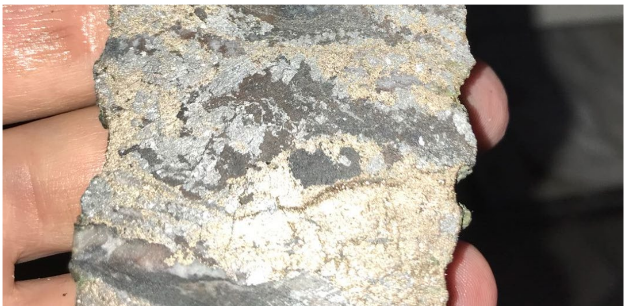
(Figure 2: Stringers of Co-Ni mineralization in low grade metamorphic sediments.)

Under the prospecting license, staff and consultants to LEMR compiled historic data, sampled historic mine waste dumps, completed preliminary ground geophysics and soil sampling. The success of the prospecting work greatly benefited from using the services of Radioactive Mineral Magurele SA, a state owned company under the Ministry of Energy, which has decades of experience and expertise for exploration activities locally and has all necessary permits to perform those according to the highest technical and safety standards. Historic mining tapped Co-Ni mineralization deposited at the top of a regional carbonate level and overlying dark schist in the form of replacement bodies and dissemination. Within a 5 x 2 km zone, grab samples were taken from 7 waste dumps near gallery mouths, mostly disseminated mineralization in dark schist and carbonate. Both, cobalt and nickel grades in these rocks, are often in the percent-range, increasing strongly as stringers occur (see Figure 2), which locally lead to massive Co-Ni-ore pockets.