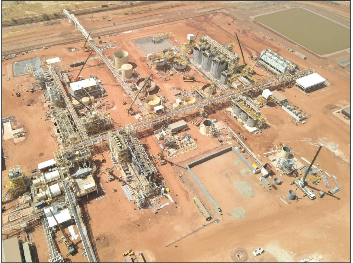
Figure 2: Crushing circuit construction is complete and wet commissioning of the primary jaw crusher is underway