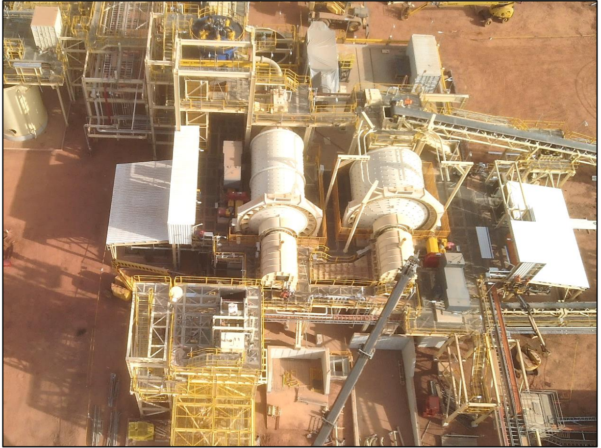
Figure 4: Flotation circuit construction is largely complete and sulphide concentrate is expected to be delivered to the BIOX ® circuit in early March