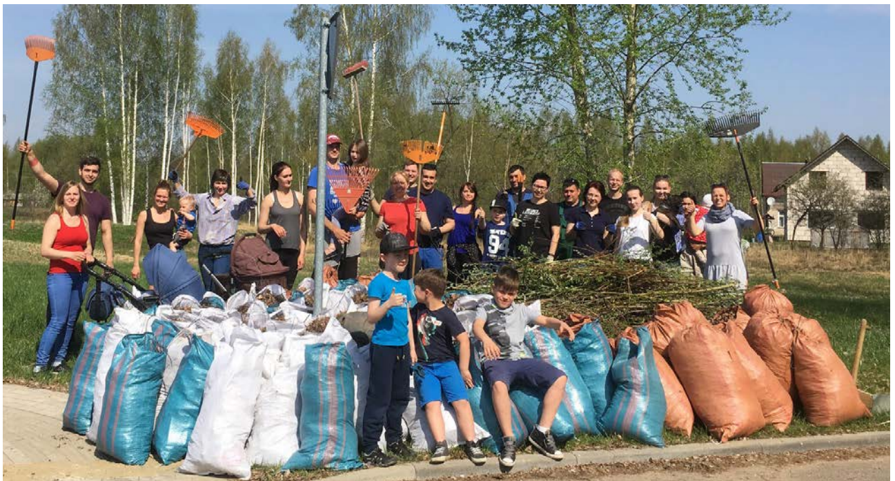
Photo: In 2019 as well, for the fifth consecutive year AS VALMIERAS STIKLA ŠĶIEDRA team participated in the all-Latvian cleanup initiative "Lielā Talka" meanwhile joining in on #TrashTagChallenge.

Based on inspection results in 2019 supervising authorities did not give any significant criticism or impose any sanctions related to the work of the companies of the GROUP.