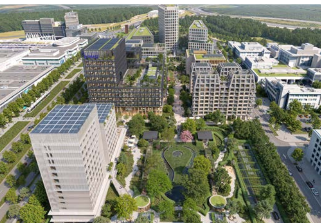
CFE • Kennedy Park in Kirchberg, Luxembourg (artist impression)

In Multitechnics , revenue for the quarter was 83.0 million euros, up 21.2% compared to the first quarter of 2025. Activity was par-