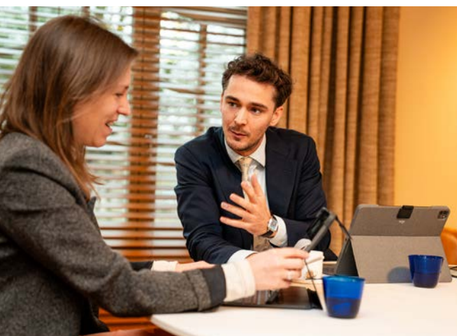
Delen Private Bank • Client meeting

(1) Already included in AuM Delen Continental