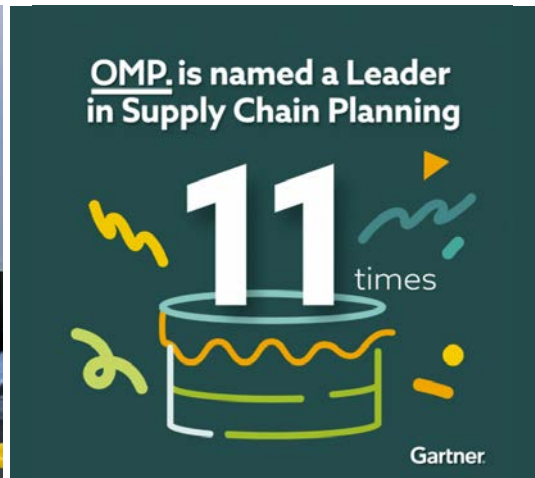
OMP • Leader in the 2026 Gartner® Magic Quadrant™ for Supply Chain Planning