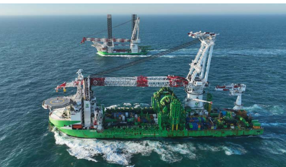
Orion and Norse Energi, crossing each other in the English Channel.

Global macroeconomic turbulence and uncertainties notwithstanding, DEME's operations remain robust, and management continues to focus on delivering sustainable, profitable results. Following a solid first quarter, DEME's management reaffirms its 2026 guidance which calls for turnover and EBITDA margin to be in line with 2025. CapEx for 2026 remains projected to be around 450 million euros, including upgrade, repair and maintenance investments in the fleet and the payment for the completion of Norse Energi. Potential further large capacity expansion to support longer term growth opportunities is not included at this stage.