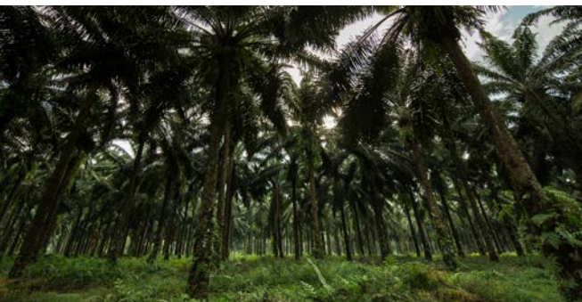
SIPEF • Bukit Maradja plantation in North Sumatra, Indonesia

Banana production amounted to 14,919 tons, representing a 2.9% increase year-over-year. Performance varied across sites, which weighed on overall output. While first-quarter production was below initial expectations due to agronomical conditions, ongoing improvements at key sites and supportive weather conditions are expected to contribute to a gradual recovery in the coming months. SIPEF continues to market banana volumes through annual fixed-price contracts, providing stability in a volatile market environment. Demand in Europe remained broadly stable in the first quarter, while regional markets continue to develop.