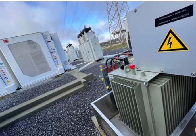
GreenStor • DSTOR battery park in La Louvière, Belgium

MRM Health (AvH 17%) announced on April 30 that MH002, its lead product candidate, has been granted Fast Track designation by the U.S. Food and Drug Administration (FDA) for the treatment of mild-to-moderate ulcerative colitis.