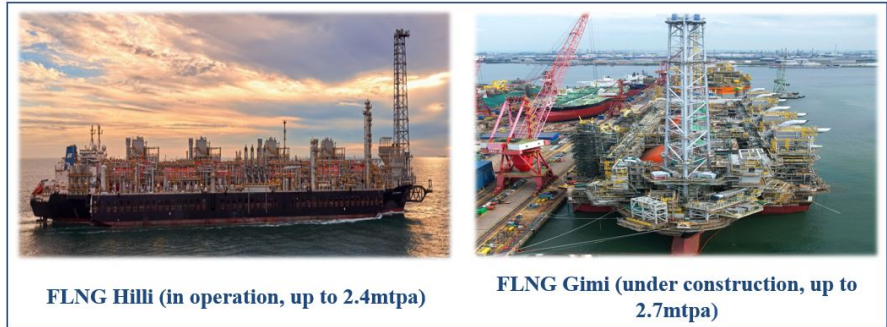
FLNG Hilli (in operation, up to 2.4mtpa)