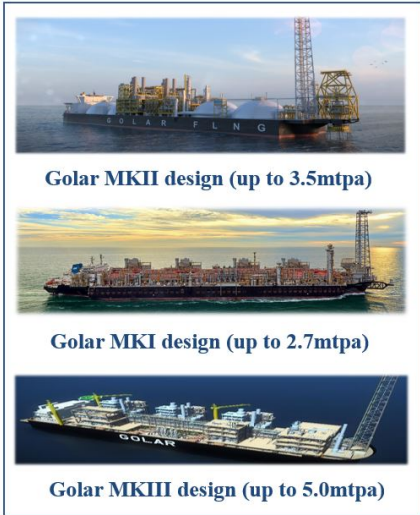
Golar MKII design (up to 3.5mtpa)