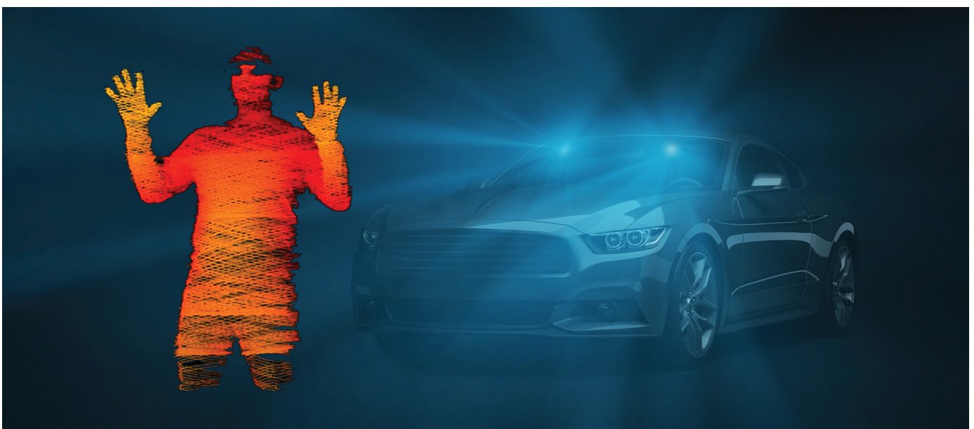
Scanning of a man with VoxelFlow™.