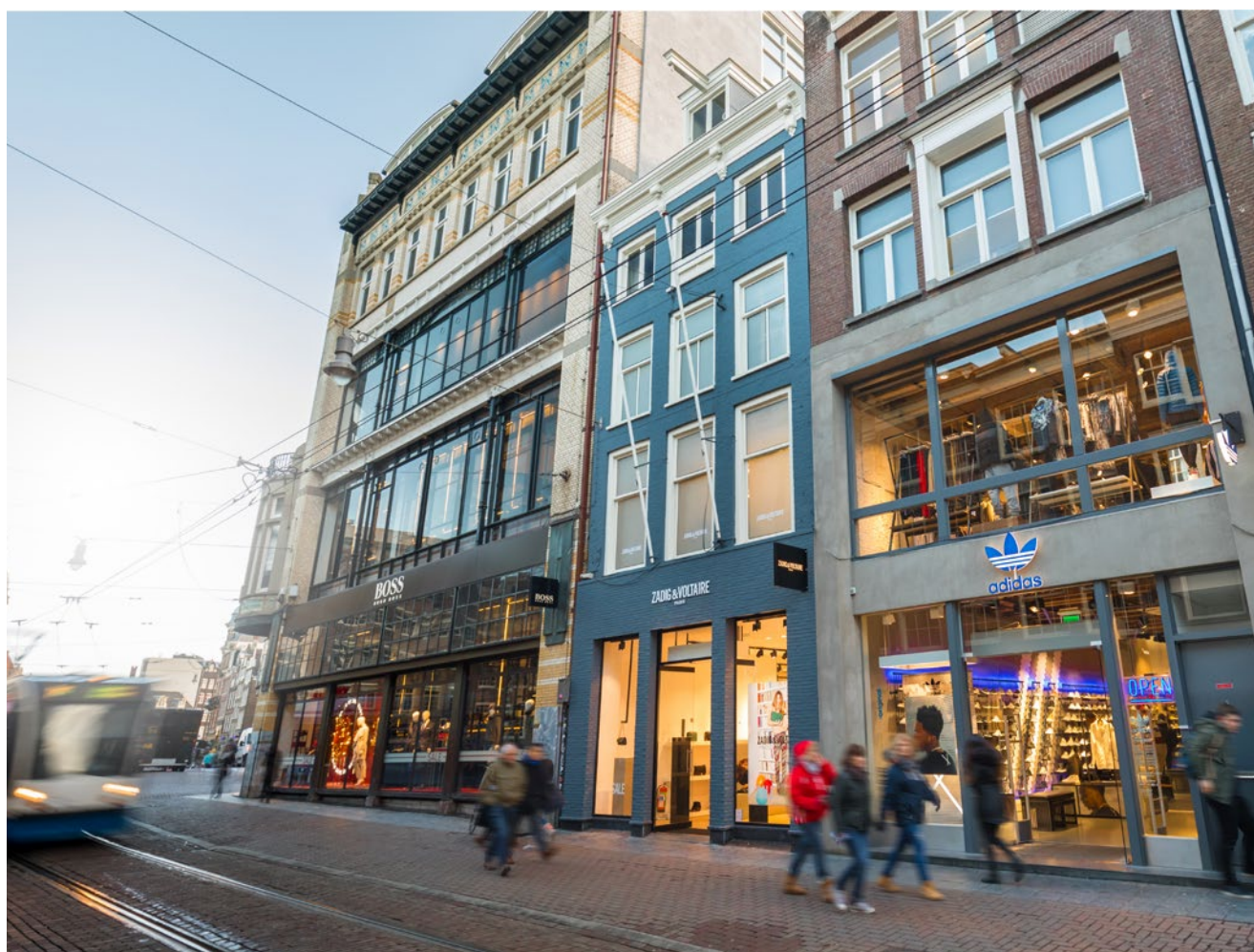
Amsterdam Leidsestraat • Zadig&Voltaire