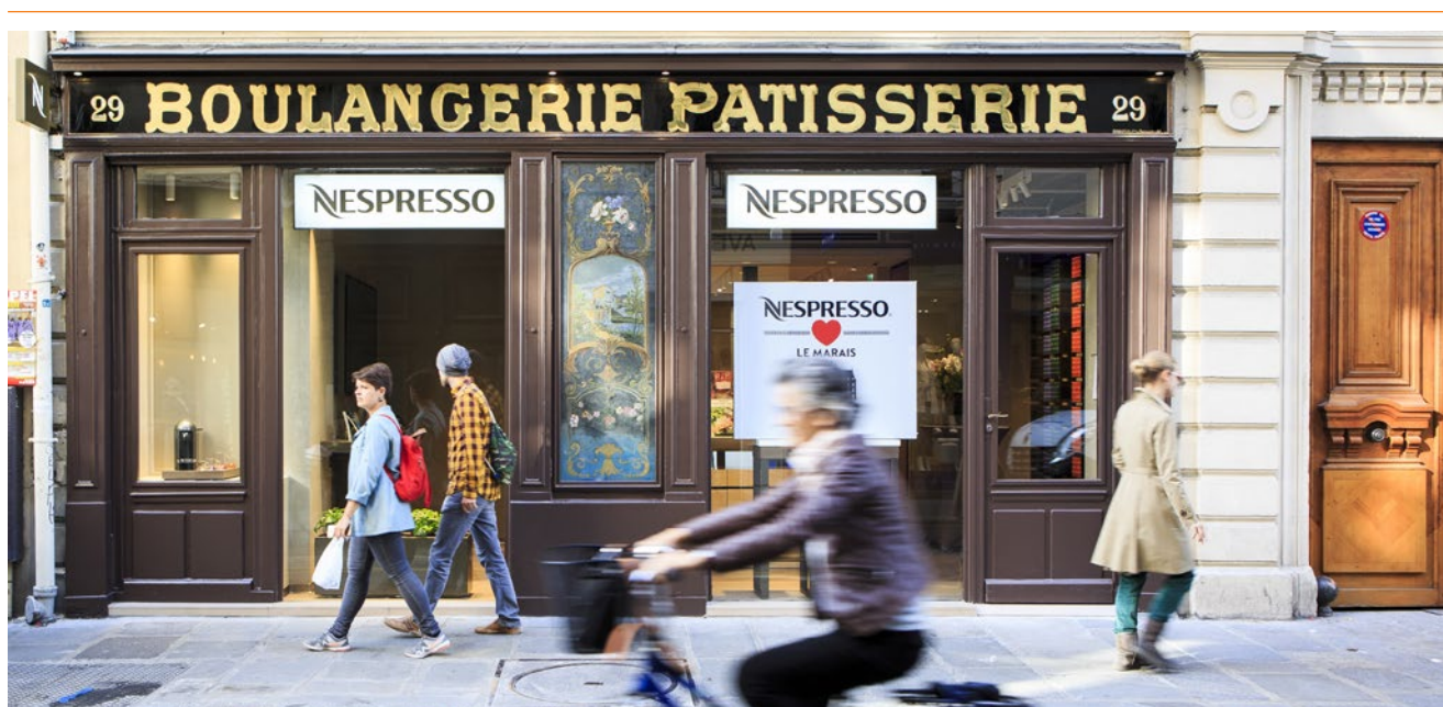
Paris Rue des Francs Bourgeois • NESPRESSO