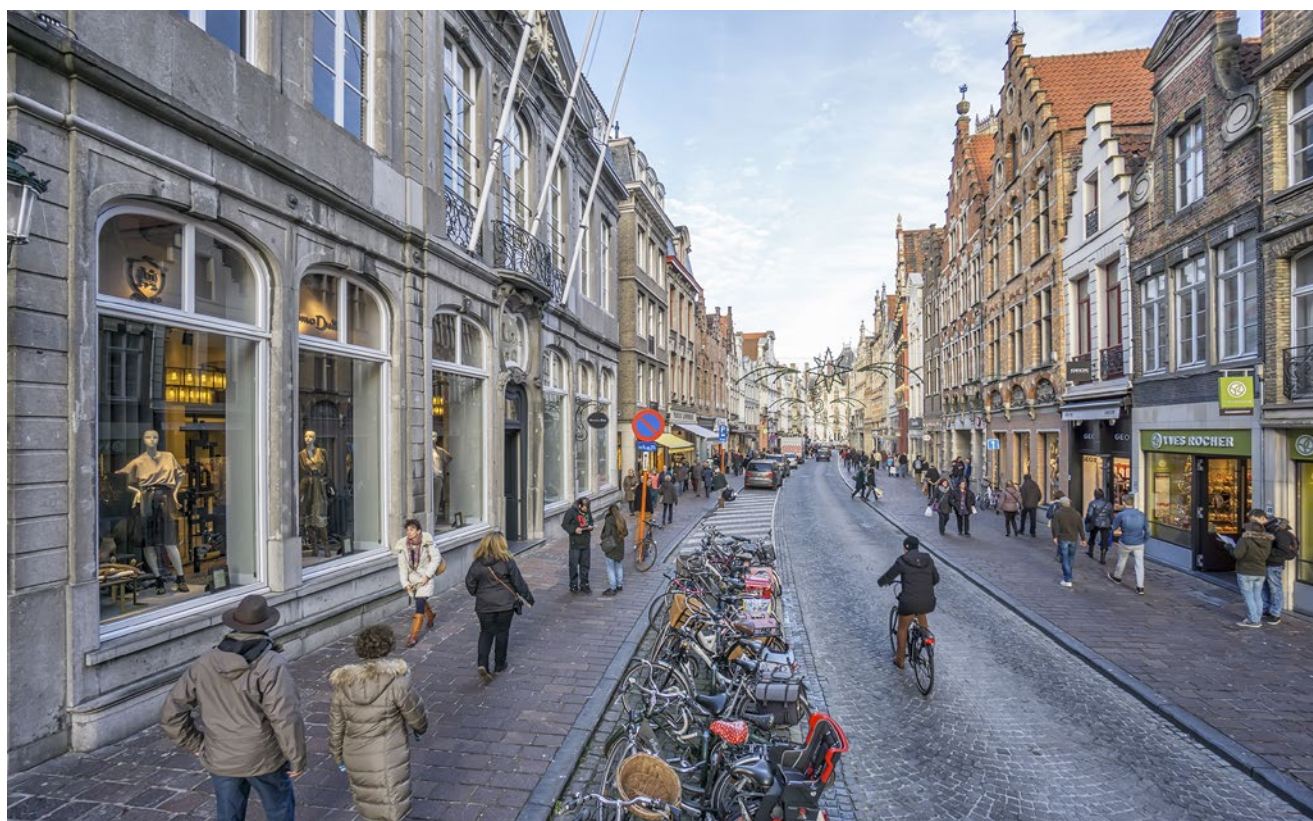
Bruges Steenstraat • Massimo Dutti

In addition to the refinancing of the existing credit lines, Vastned also entered into Interest Rate Swaps (IRS) contracts to hedge the interest rates on these credit facilities. By January 2024, € 65.0 million had already been hedged through IRS contracts. Additional IRS contracts were entered into force during the year, as a result of which a notional amount of € 80.0 million was ultimately hedged, corresponding to 79% of the drawn credit facilities on 31 December 2024.