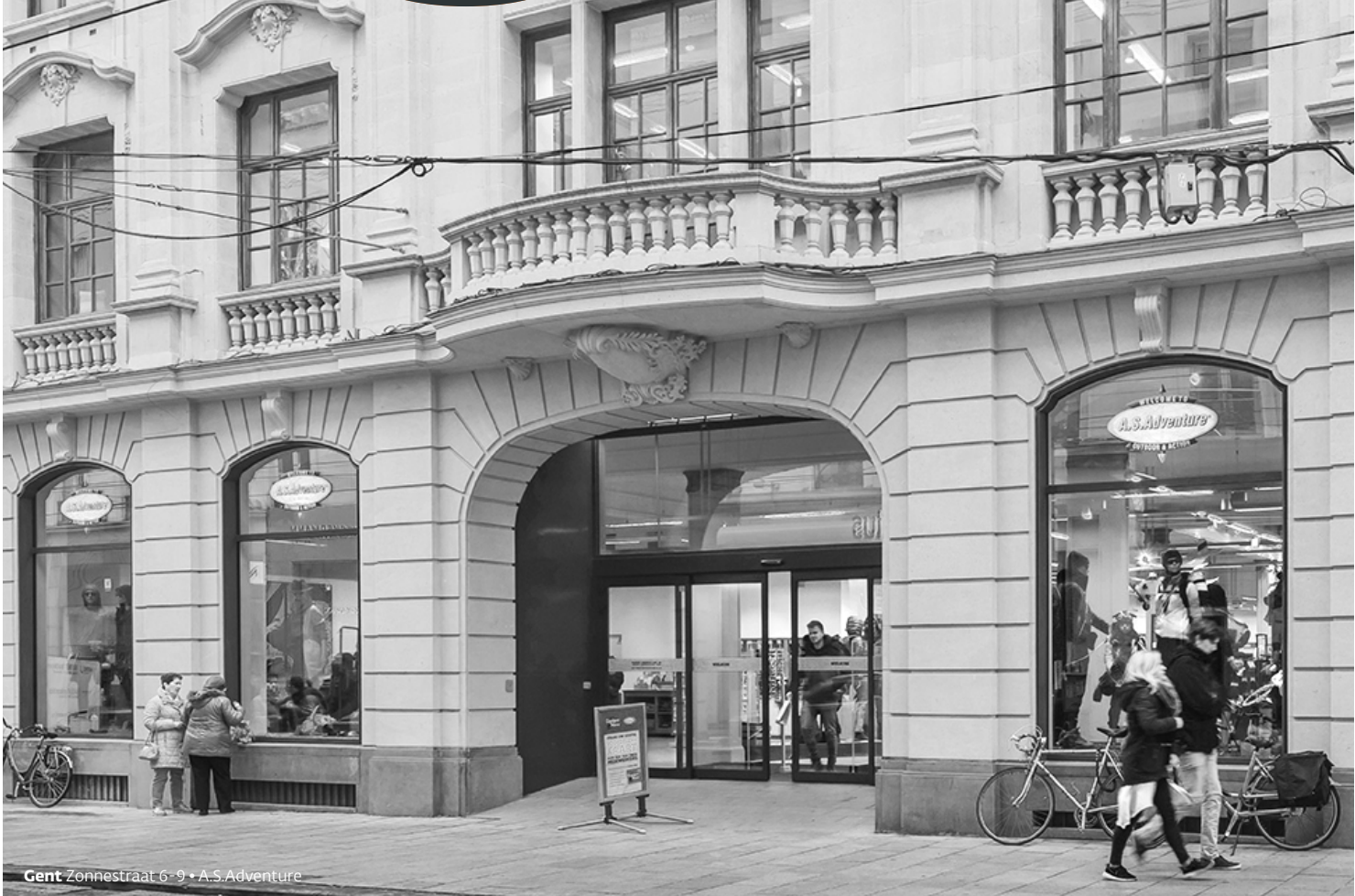
Gent Zonnestraat 6-9 • A.S. Adventure