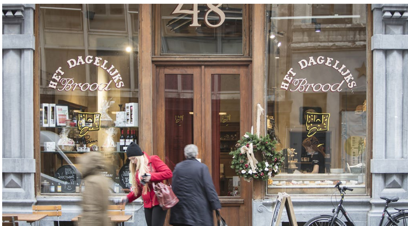
Antwerp Steenhouwersvest • Le Pain Quotidien

The fair value of these two retail properties together amounts to € 10.2 million.