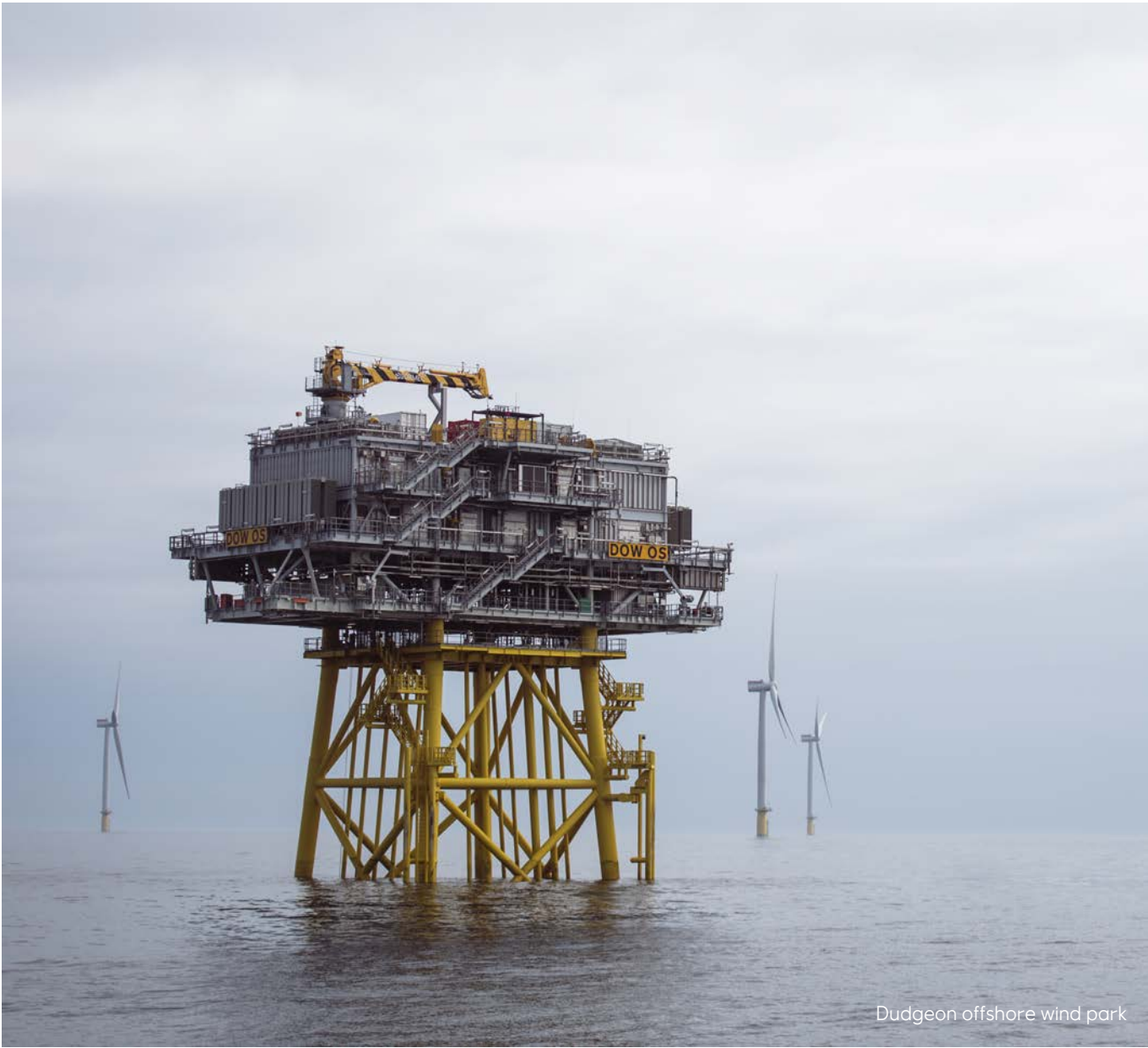
Dudgeon offshore wind park