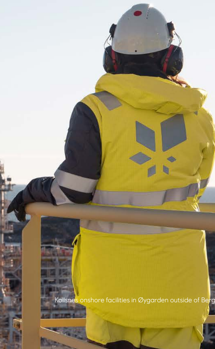
Kollsnes onshore facilities in Øygarden outside of Bergen.