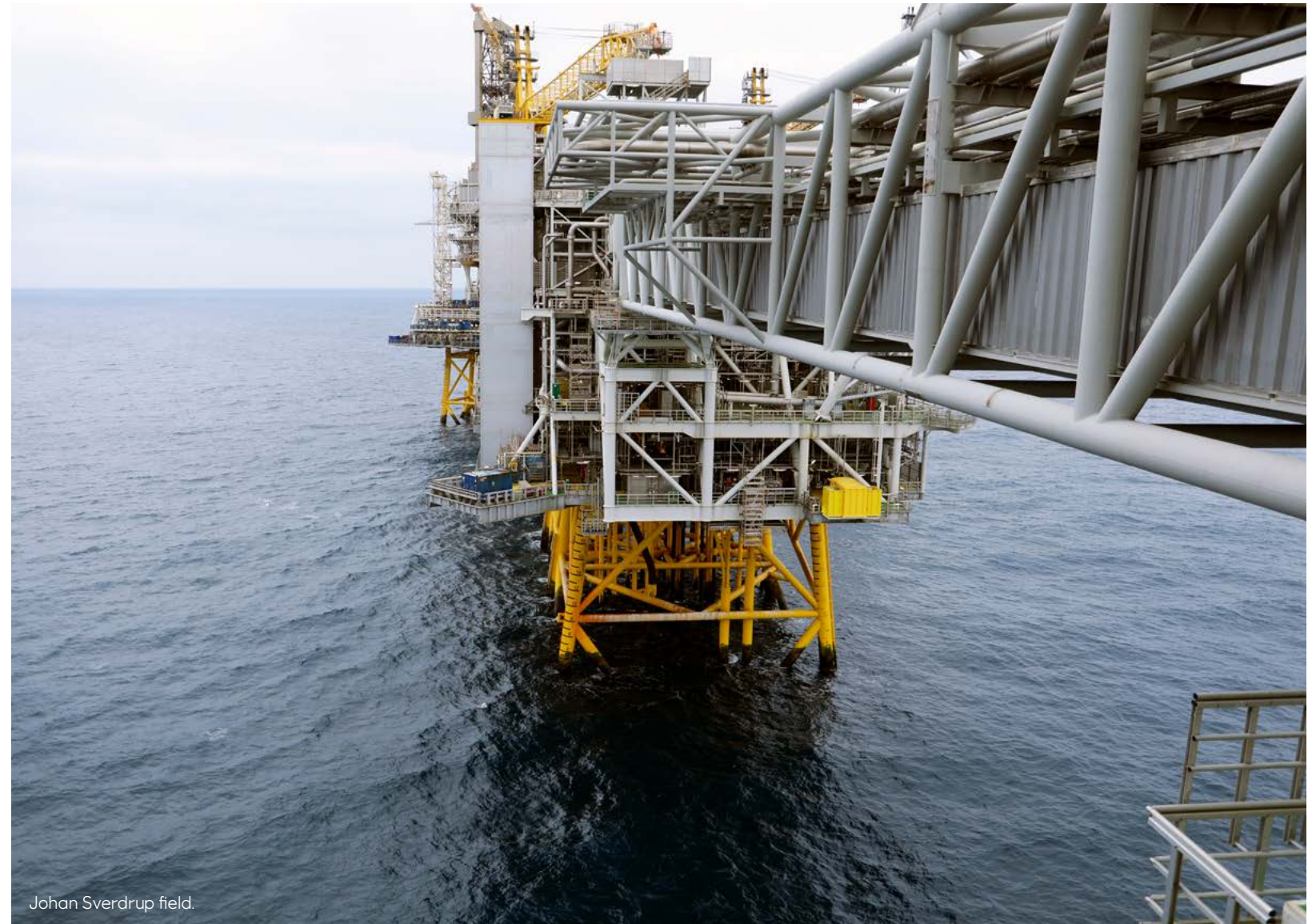
Johan Sverdrup field.

The board of directors has decided to announce a two-year share buy-back programme for 2024-2025 of USD 10-12 billion in total, with up to USD 6 billion for 2024. The share buy-back programme will be subject to market outlook and balance sheet strength. The first tranche of up to USD 1.2 billion of the 2024 share buy-back programme will commence on 8 February and end no later than 5 April 2024. Commencement of new share buy-back tranches after the first tranche in 2024 will be decided by the board of directors on a quarterly basis in line with the company's dividend policy and will be subject to existing and new board authorisations for share buy-back from the company's annual general meeting and agreement with the Norwegian State regarding share buy-back.