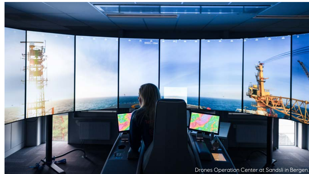
Drones Operation Center at Sandsli in Bergen.

This press release contains Forward Looking Statements. Please see the Forward Looking Statement disclaimer published on Equinor.com/investors/cmu-2024-forward-looking-statements .