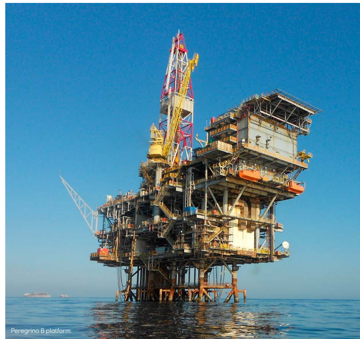
Peregrino B platform.