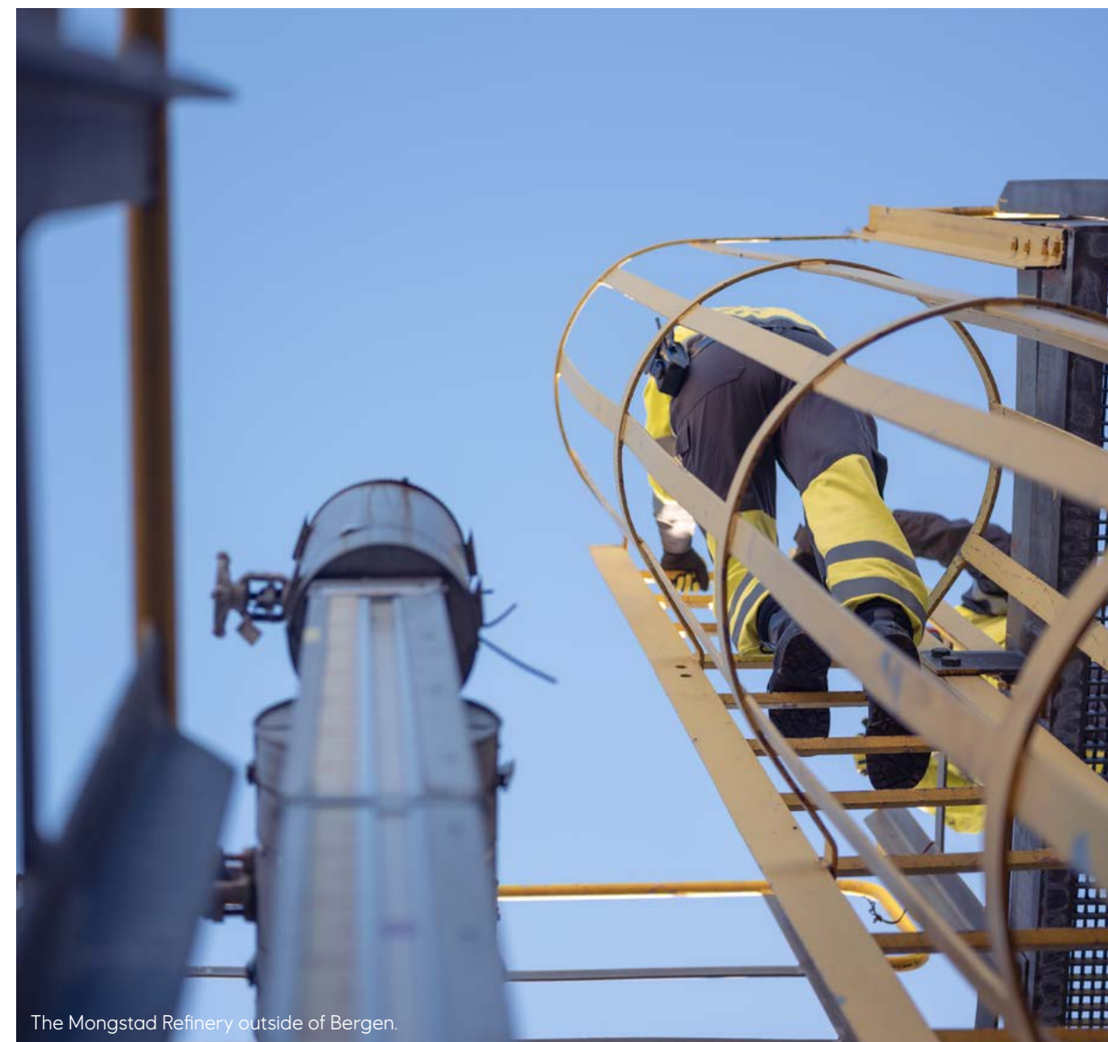
The Mongstad Refinery outside of Bergen.

Net operating income includes net effects from changes in fair value related to storage and commodity derivatives utilised to manage price risk exposure. During 2023, the net operating income included impairments amounting to USD 343 million, in contrast to USD 895 million in net impairment reversals in the prior year.