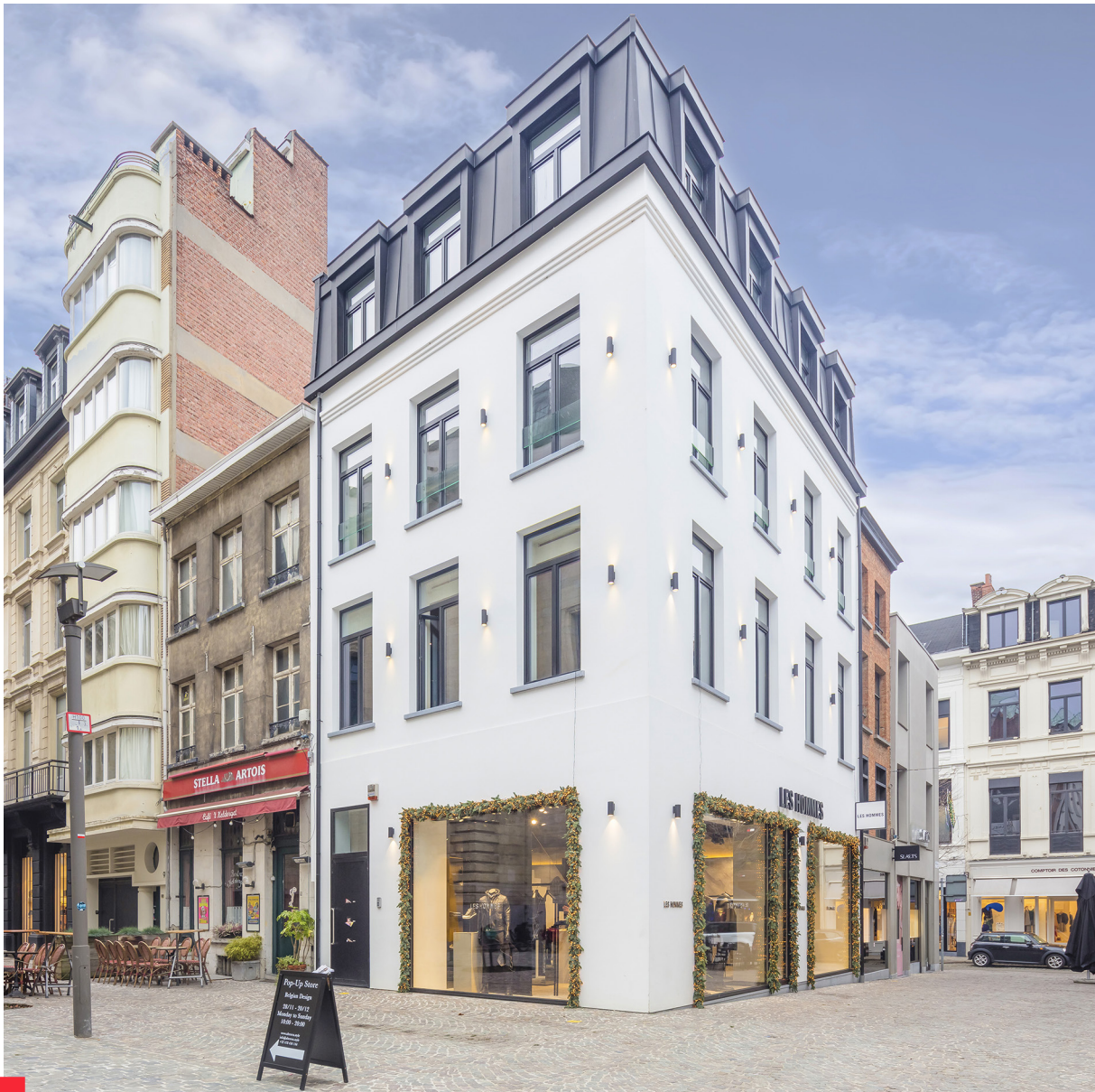
Antwerp - Armeuveelstraat - Les Hommes