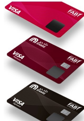
A standard-format smart card, utilizing our fingerprint authentication solution, offered by First Abu Dhabi Bank and manufactured by our customer, IDEMIA France SAS

We do not own or operate capital-intensive manufacturing facilities, but operate as a fabless manufacturer, utilizing third parties for outsourced manufacturing and product assembly capabilities. We currently rely on Taiwan Semiconductor Manufacturing Company, Limited (“TSMC”), the leading producer of semiconductor wafers, as the sole source of wafers for our proprietary ASIC designs. We also rely on a limited number of providers of outsourced semiconductor packaging, design, and test services, including Amkor Technology, Inc., and Silicon Precision Industries, Limited, both of which are leaders in outsourced semiconductor assembly and test services.