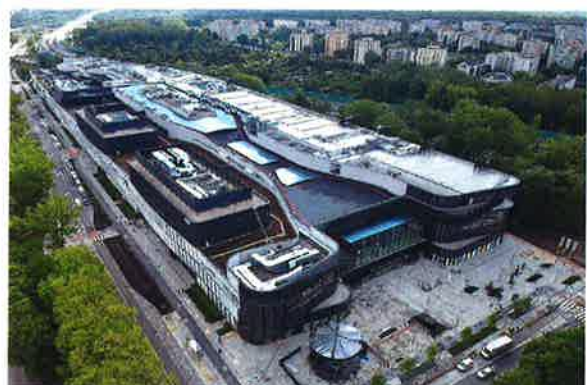
Galeria Młociny shopping center