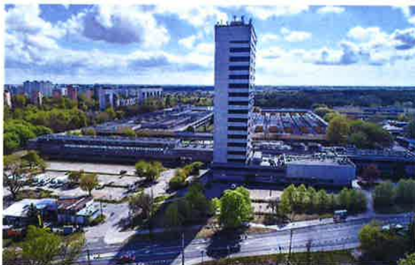
CeMat & PKO BP office building

The surrounding area has undergone significant development over the past few years with a large number of new investments, including residential, retail and service buildings. The local real estate market is strong and there is high demand among investors and developers. The large new shopping mall, Galeria Młociny, constructed 2km away from the CeMat '70 property, is an example of this trend. A new 30m-high residential building is being constructed 400m away, and an office building for PKO BP (a Polish bank leader) is also located in the immediate vicinity.