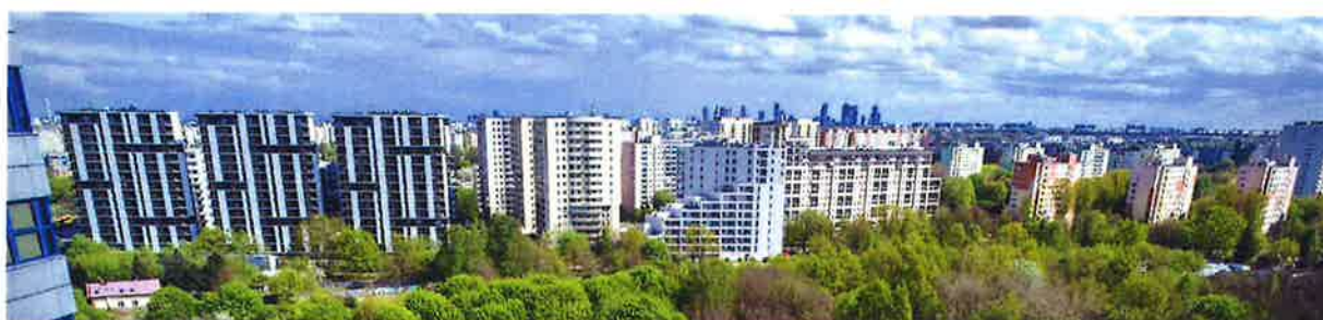
Panoramic view of Bielany district.

Warsaw's metropolitan area covers 3.1 million residents, which makes it the 8th most populous capital city in the European Union.