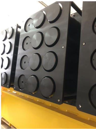
Figure: IGBT A Module

The first new 6 th generation source system, Tx-D 5006, will replace the Conventional Source as a backup for the Deep Blue (Tx-D 10005) and will be capable of transmitting up to 5000 ampere.