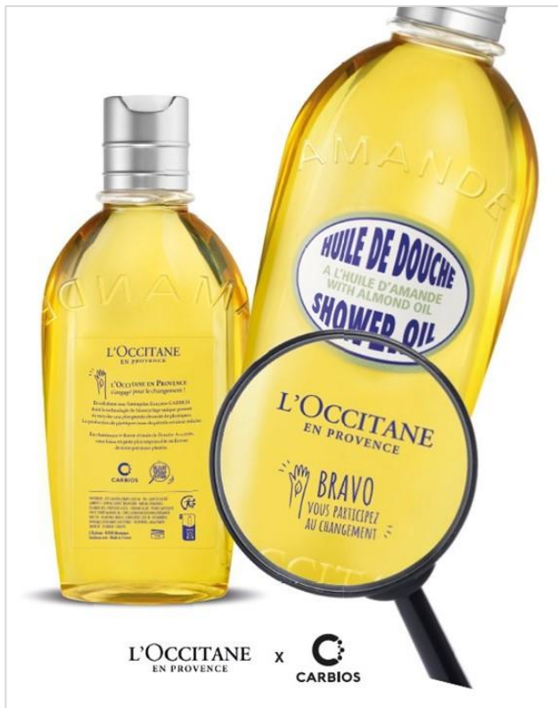
Figure 1: L'OCCITANE en Provence's first bottle made from 100% enzymatically recycled PET using CARBIOS' technology

Clermont-Ferrand and Manosque (France), Thursday 30 May 2024 (6pm CEST). CARBIOS , (Euronext Growth Paris : ALCRB), a pioneer in the development and industrialization of biological technologies to reinvent the life cycle of plastic and textiles, and L'OCCITANE en Provence , an international cosmetics brand using natural and organic ingredients, a long-term partner of CARBIOS, present a bottle in transparent PET made entirely from enzymatic recycling for a shower oil from the Amande range. In collaboration with Pinard Beauty Pack , this bottle exemplifies a shared desire to build an efficient European recycling sector to accelerate the transition to a circular economy for plastic, and meet brands' commitments for more sustainable packaging solutions. The bottle will be on display at CARBIOS' Stand D02 at "Edition Spéciale" by LuxePack, the trade show dedicated to sustainable premium packaging, to be held on 4-5 June 2024 at the Carreau du Temple in Paris.