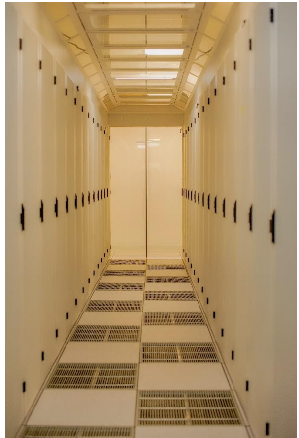
Part of the data hall

OADC TEXAF DIGITAL, the joint venture with the WIOCC group, opened the DRC's first tier-III data centre to its customers in August. The banks RAWBANK and SOFIBANQUE, the pan-African cloud services operator ST DIGITAL and the French virtualisation and storage company LENUMERIC have already announced that they will be housing their servers there.