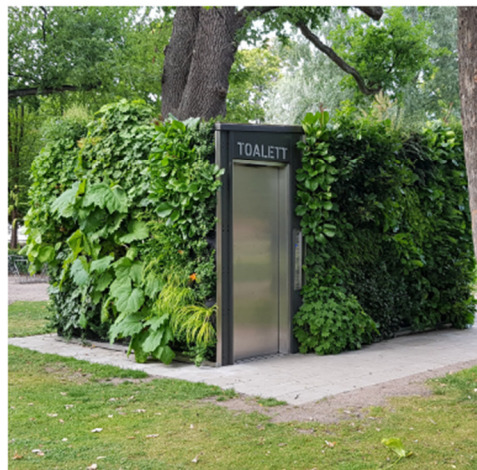
Uppsala, Sweden, Design JCDecaux