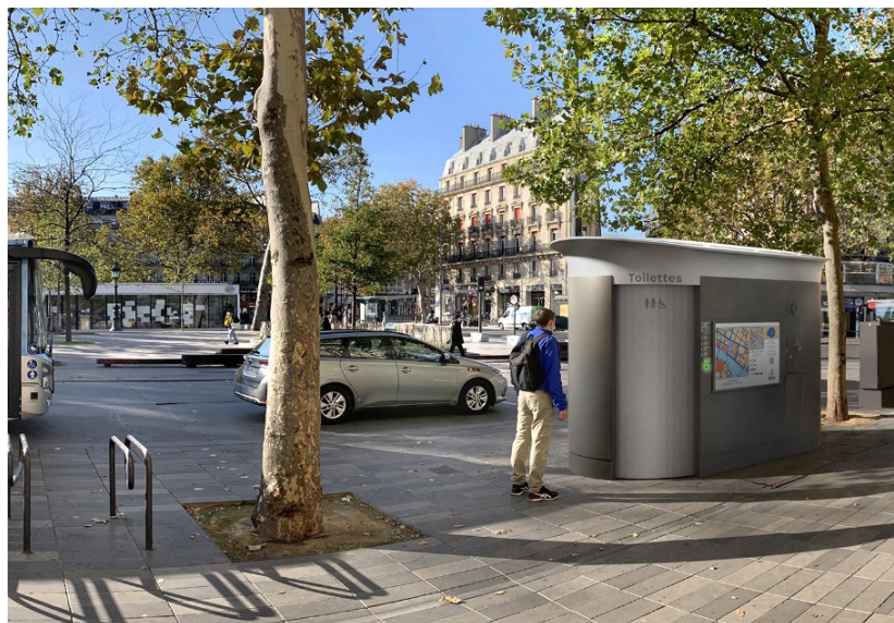
Front view of the City of Paris' new self-cleaning public toilets

JCDecaux was selected by the City of Paris to supply and operate its new automatic public toilet service, replacing the existing facilities installed in 2009 that were also operated by JCDecaux. These new toilet facilities, which were designed and assembled in France, will increase access to the service in Paris: 435 new-generation automatic toilets will be rolled out between 2024 and the beginning of 2025. In addition to providing a spacious cabin that enables universal access, the new street furniture facilities will also be equipped with a second urinal cabin, complete with a door and roof to ensure user privacy. The waiting time between each visit to the main cabin will be reduced by a third, with the time between a customer leaving the toilet and it being available for the next customer reduced to just 30 seconds. During this time, the toilet cabin will be cleaned and disinfected for the comfort of the next user. The urinal cabin will be disinfected immediately after each user visit and available immediately with no waiting time.