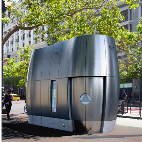
Photomontage - Coming soon in San Francisco, USA, Design Smith Group

New public toilets designed by JCDecaux for San Francisco will soon be launched in the city centre, continuing the collaboration initiated in 1994.