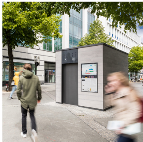
Berlin, Germany, Design Wall / JCDecaux