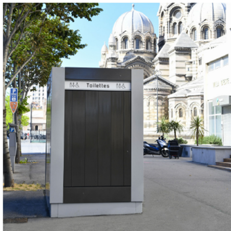
Marseille, France, Design JCDecaux

Public toilets have specific requirements and cannot be compared to other street furniture. Their operation demands a clear understanding of usage, along with expertise in design and operation. Through this unique expertise, JCDecaux has become the operator of the world's largest network of self-cleaning public toilets. Today, many cities around the world such as San Francisco or Stockholm can install public toilets fully funded by advertising on street furniture, benefiting from the economic model invented by JCDecaux. The Group operates over 2,500 self-cleaning toilets in 28 countries, used by almost 31 million people every year, including 15 million in Paris. Its self-cleaning public toilets are an integral part of the global urban landscape. From Paris to Berlin via Marseille, Abidjan and Lagos, JCDecaux's street furniture and associated services are designed to evolve with their environment and their needs across the globe.