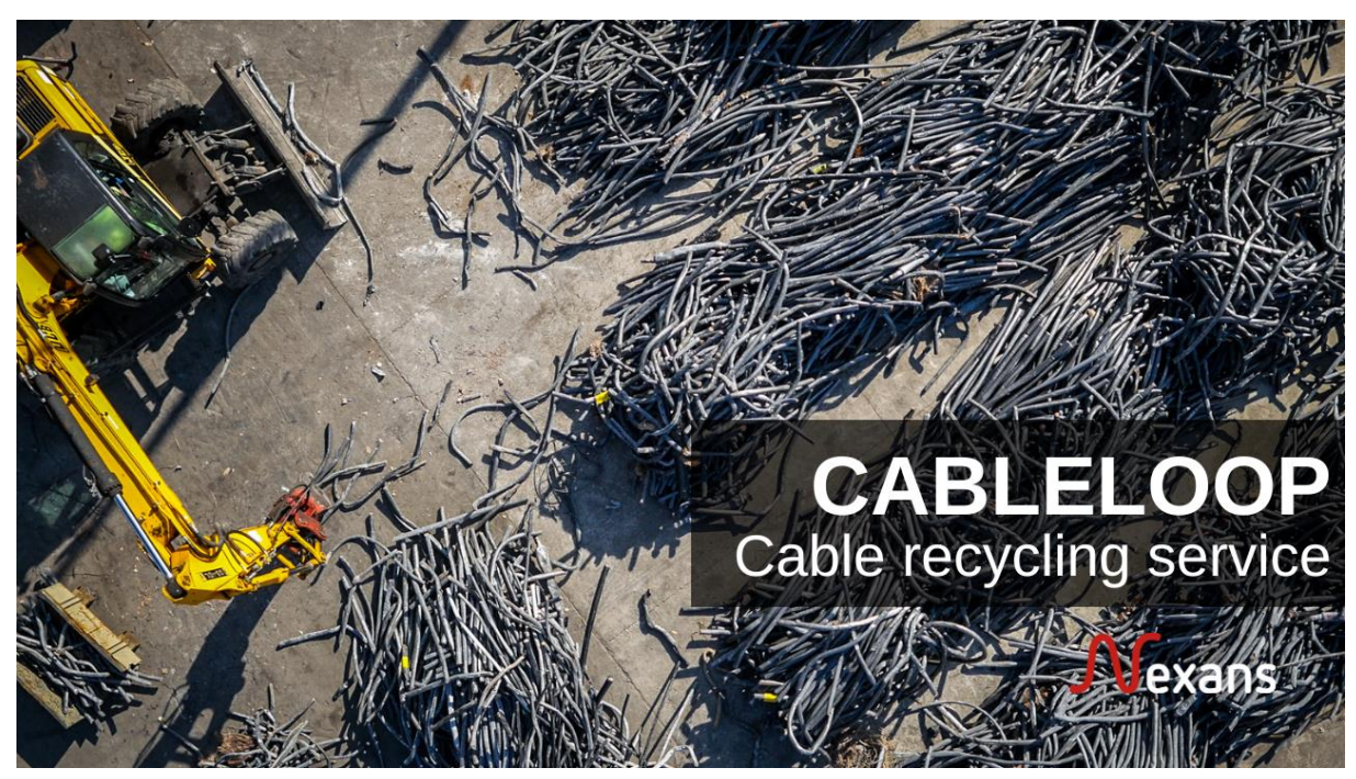
Watch the CABLELOOP Enterprises video to find out more