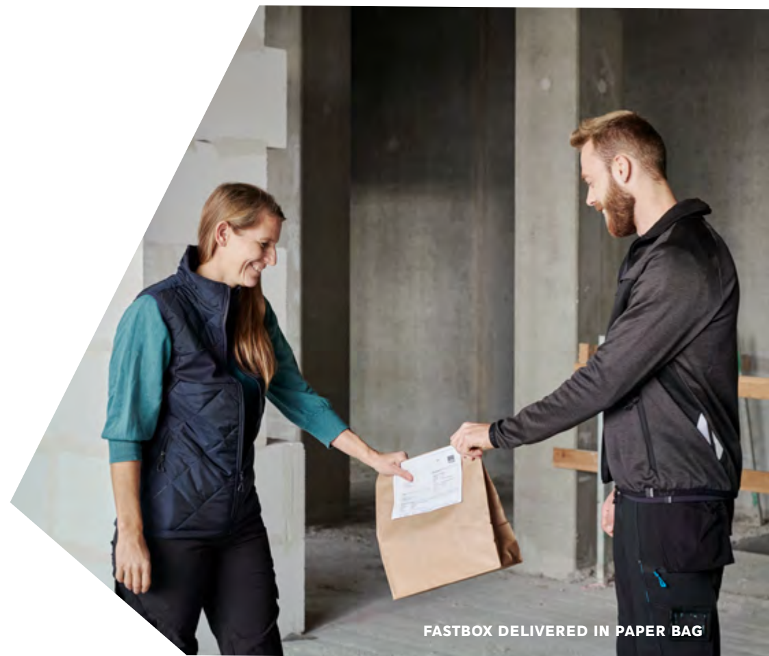
FASTBOX DELIVERED IN PAPER BAG

This initiative has resulted in a number of gains: it benefits the environment, our customers are spared the need to dispose of the plastic, it makes packaging easier for our warehouse employees and it reduces the costs.