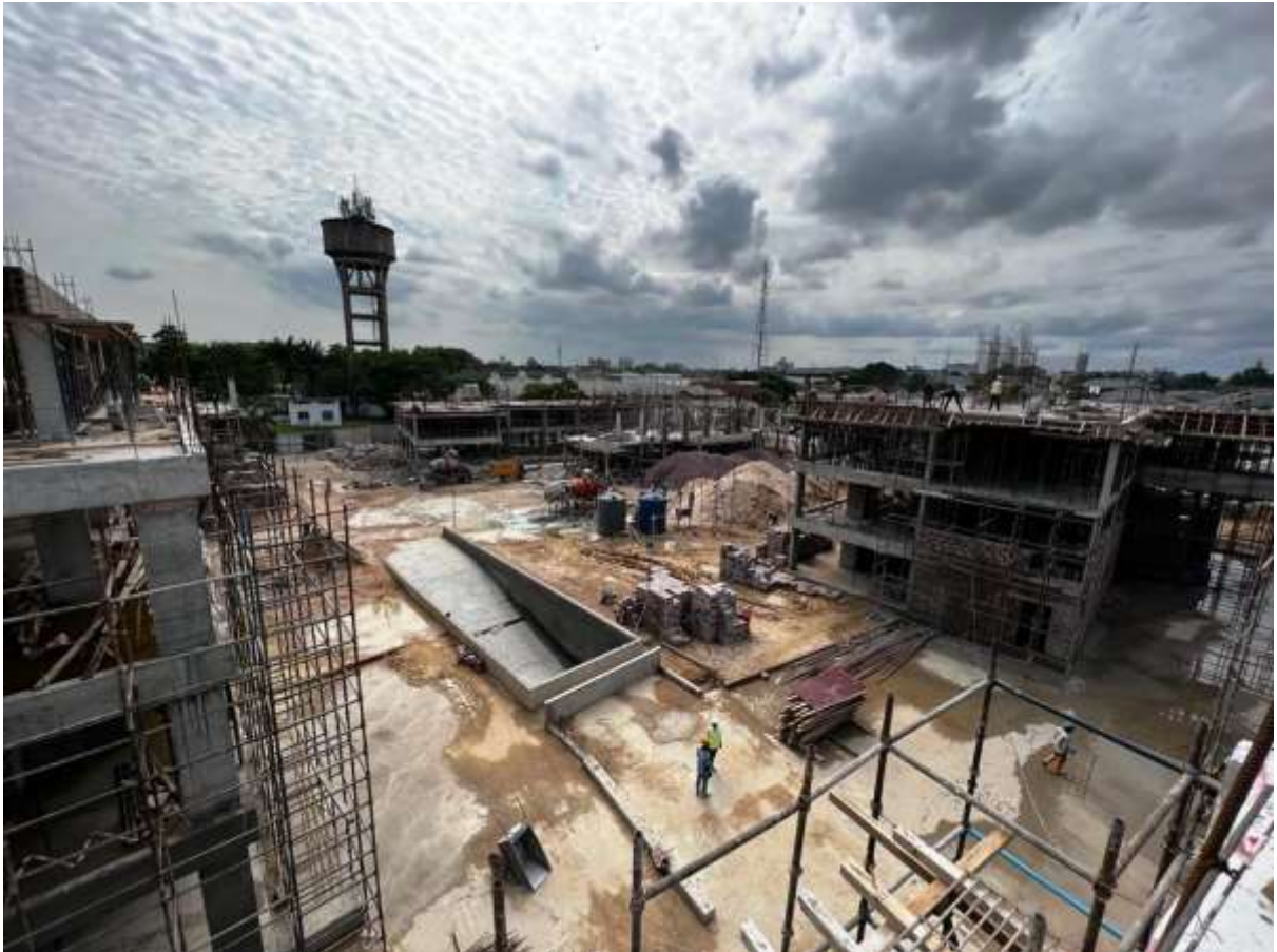
Promenade des artistes project

The construction of the Group's two largest projects, SILIKIN VILLAGE phase 3 and Promenade des Artistes (94 apartments), is continuing. SILIKIN VILLAGE III has been divided into two phases, the first of which will be delivered in September 2023 and the second in 2024.