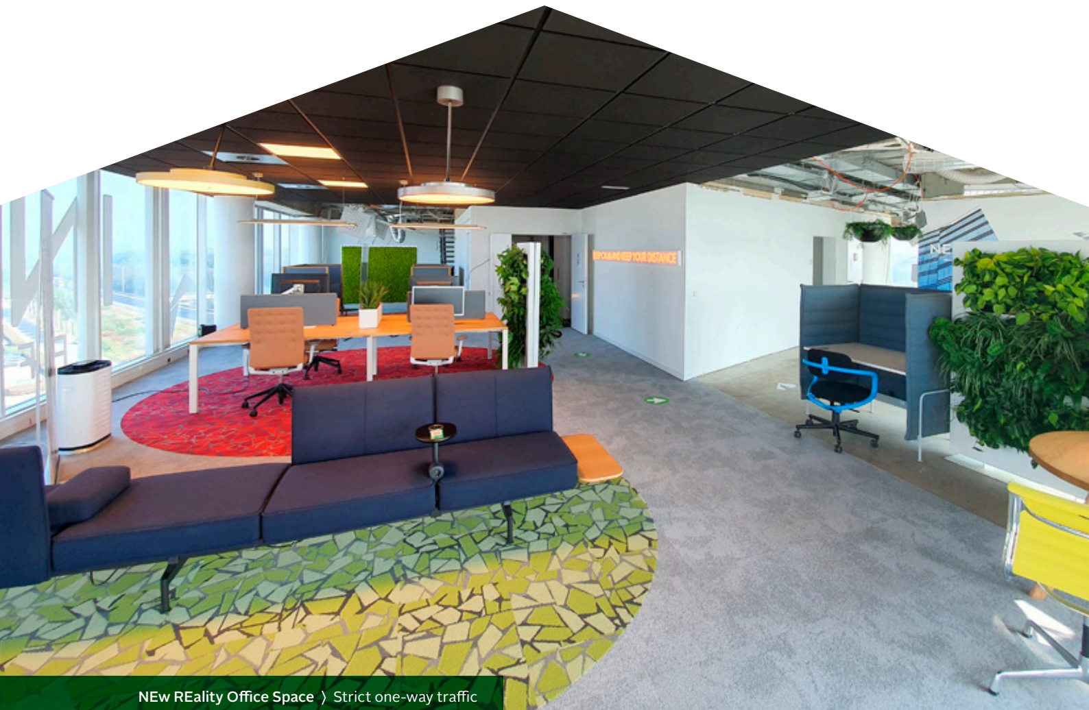
NEW REality Office Space › Strict one-way traffic

NEREOS applies strict one-way traffic in both public and private spaces. Clear direction indicators - in the form of stickers on floors and walls or 3D LED displays - encourage this behaviour. This allows you to integrate the desired walking direction aesthetically into the design.