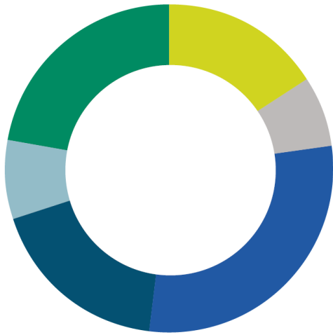
Portfolio analysis by sector (including cash & liquid investments)