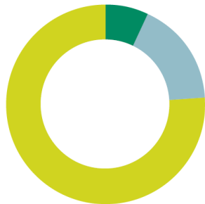
Portfolio analysis by stage of investment

Comparatives for 31 December 2022 are in brackets